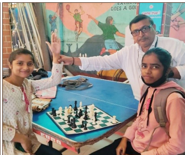
FUN FAIR SPORTS