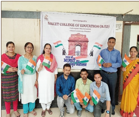
AZADI KA AMRUT MAHOTSAV